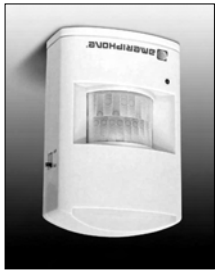
ALERTMASTER® Transmitter Motion Sensor (AM-SX) Works with ALERTMASTER® Product Series

12082 Western Avenue, Garden Grove, CA 92841 VOICE (800) 874-3005 TTY (800) 772-8899 FAX (714) 897-4703 ameriphoneelectronics.com www.ameriphone.com