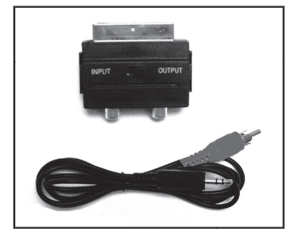
TV SCART Adaptor Cable

The Pocket Listenor can also be connected to a television, DVD and video players, or Cable TV boxes using the optional TV Scart Adaptor Cable, which is sold separately.